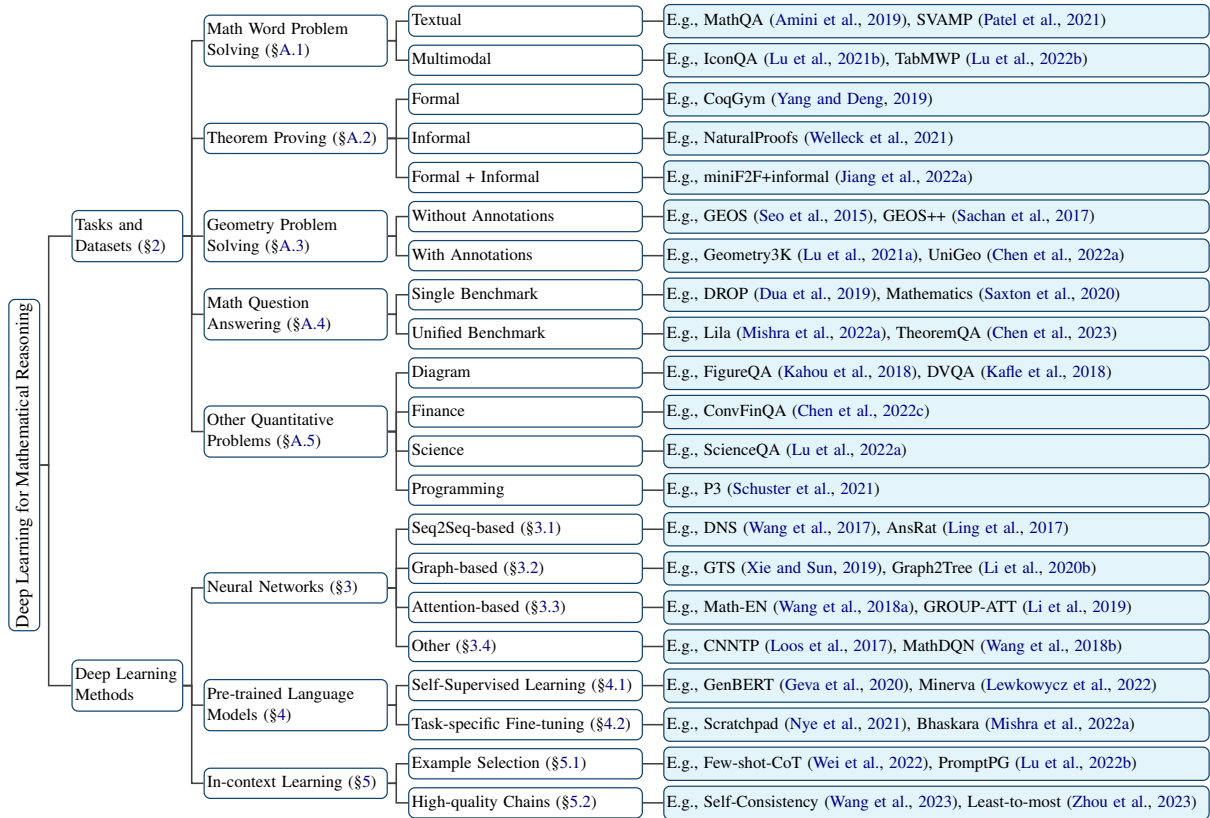
Figure 1: Taxonomy of deep learning for mathematical reasoning. The associated tasks are elaborated in §2, with a comprehensive dataset list found in §A. Deep learning methods are further discussed in §3, §4, and §5.

(§3), pre-trained language models (§4), and recent in-context learning for large language models (§5).